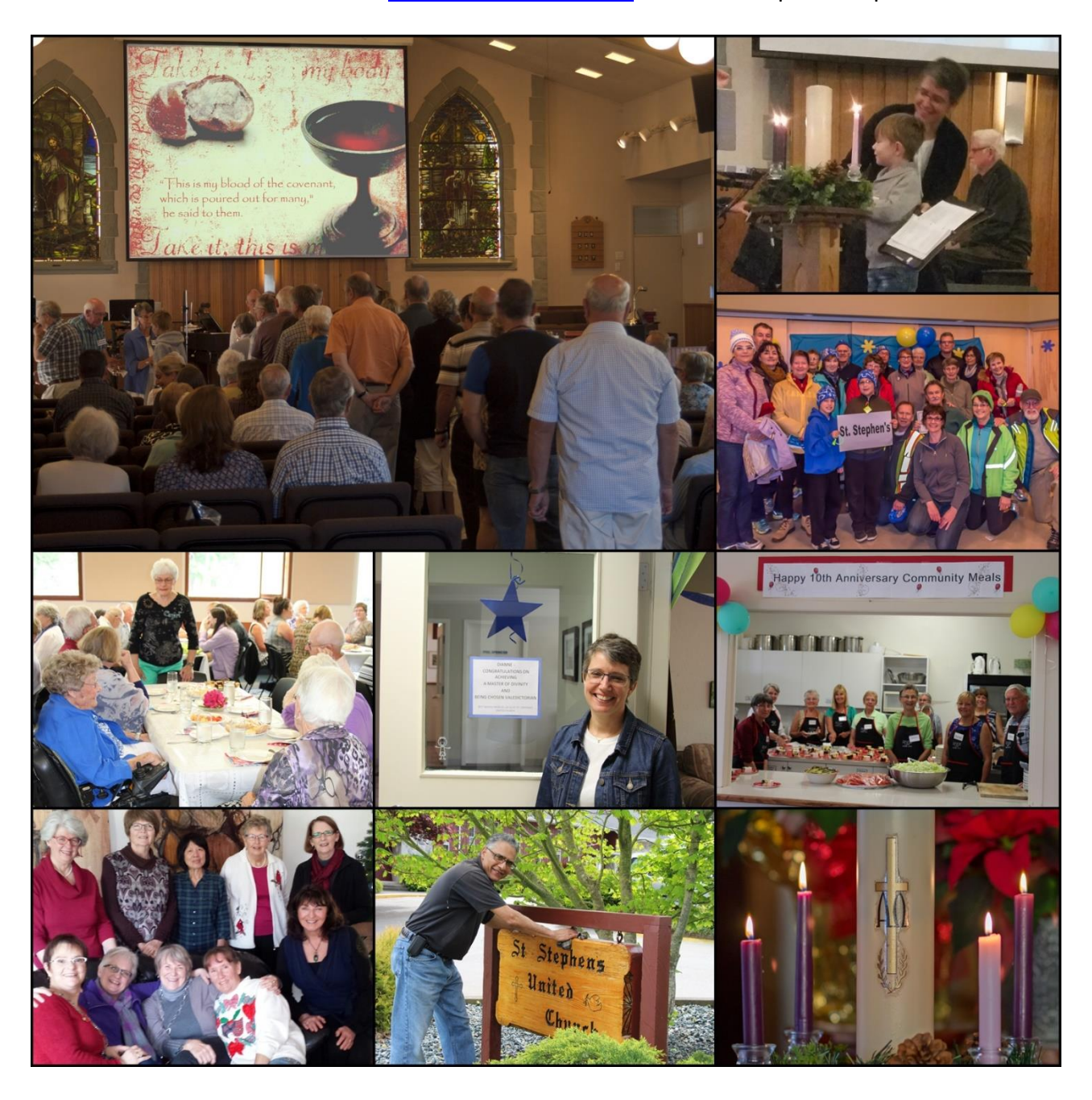
The vision of St. Stephen's United Church is to be a Jesus-centred, Spirit-led community, called and equipped to join in God's loving work in the world.

Ph: 250-752-9831 e-mail: <a href="mailto:ststephensuc@shaw.ca">ststephensuc@shaw.ca</a> Web: ststephensucqualicum.ca